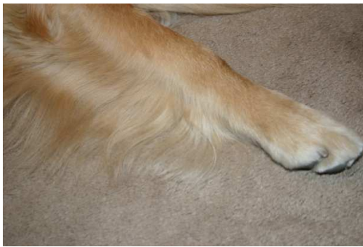
Long fur can easily become wound up.

Old Sock: If your dog has long fur on the backs on his legs, you may want to use an old sock with the toe cut off to gather the hair to keep it out of the way. This is especially true if you choose to use a nail grinder as it can easily get wound up as it spins.