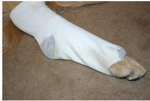
An old sock can quickly gather long fur

Treats: Dogs will probably never learn to love having their feet done. However, they can learn to tolerate it ... especially if there is something in for them! Start by using a higher-value treat such as hotdogs or cheese, whether you are just beginning with a puppy or if you tried to trim nails in the past unsuccessfully. You may be able to use a treat such as a dry biscuit later on to maintain the behavior once they learn they need to stay still.